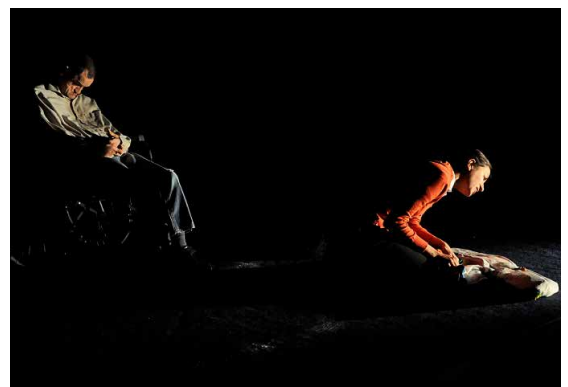
The Man Who Found His Freedom (Space Productions 2015)

Membership costs £30 per year and provides £10 tickets to all events at the Space.