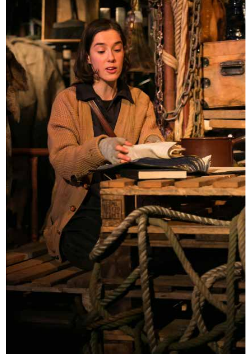
The Lighthouse (Space Productions)