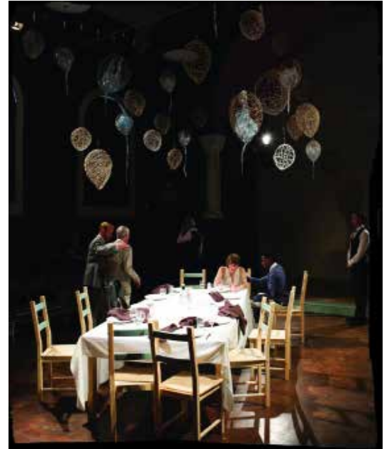
Festen (Space Productions)

We will continue to be flexible and react to the changing circumstances and restrictions at the time.