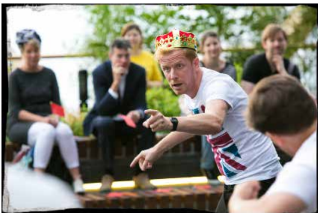
The Royal Nutshell at the Roof Garden