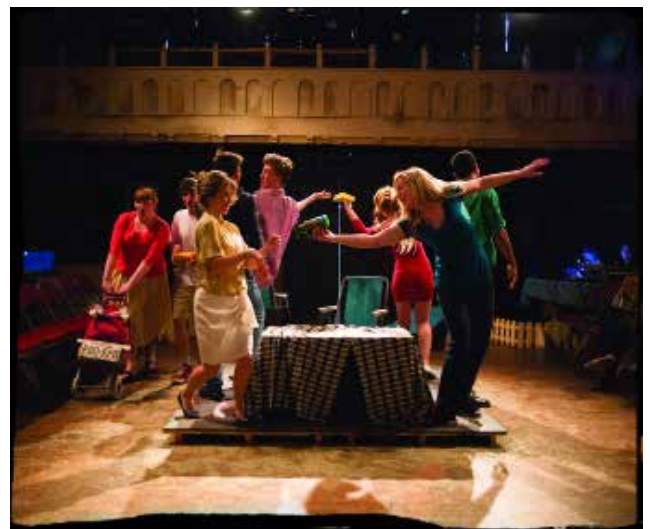
Vernon God Little (Burn Bright Theatre & Space Productions)